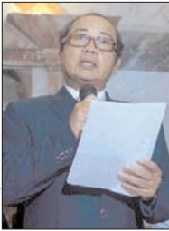
REBUTAL: Bank Indonesia Governor Burhanuddin Abdullah addresses a press conference at his office.