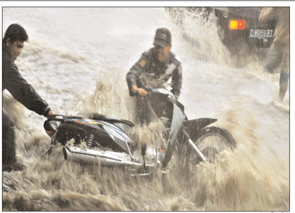
WHEELS AND WATER: Two men attempt to save a motorcycle from being washed away by floodwaters on Jl. Setiabudi in a hilly area of Bandung, West Java, Tuesday. Heavy rains and storms also caused trees to fall in several parts of the city on Tuesday.