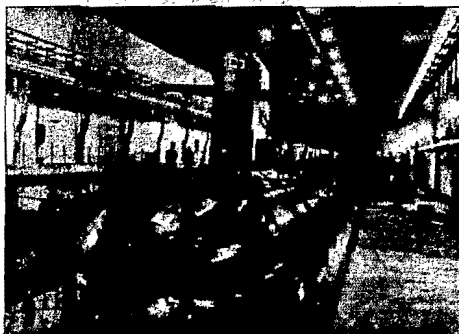
Covert underground facilities can conceal a large array of capabilities.