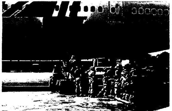
US TRANSCOM operations at Mogadishu airfield in Somalia. (U)