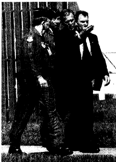
President with the commander of Barksdale Air Force Base. (U)

was reporting a possible terrorist incident at the base. Reporters in the area had noticed a significant enhancement in security at the base and had assumed the worst. They were unaware that the enhanced security was due to the imminent arrival of the president. On our final approach to the airfield, I glanced over at the military aide and saw that he had the list of passengers who would be staying with the president and of those who would remain in Shreveport. I asked him what the plan was for me. He said "Andy Card says you are to stay with us." It was 11:40 a.m. (C)