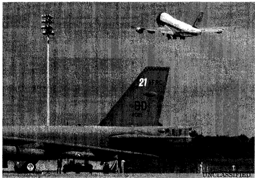
Air Force One lifting off from Barksdale AFB. (U)

At this point, Ari Fleischer interrupted our discussion. Escorting a news photographer, Fleischer wanted to give him the opportunity to take photographs of the president in a crisis, the commander-in-chief at war. While the president and Fleischer chatted, the photographer, moving about the small room, snapped dozens of pictures. (C)